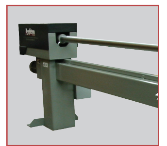
Tough frame for long service life