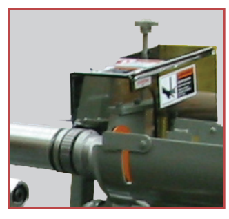
Double guarded fixed knife for operator safety