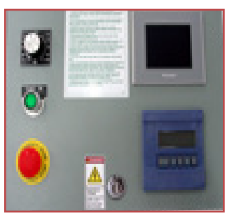
A301 Operator Panel — showing LCD, simple controls