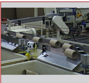
Cut core handling & sorting

Documentation – Appleton helps you avoid the frustrations of owning an “undocumented” machine. We maintain drawing files and “as-built” part numbered Bills of Material that ensure you will be able to get the support you need. Each machine comes with a set of Installation, Operation and Maintenance Manuals. Customers have complimented us time and again for the thoroughness of our manuals and their ease of use.