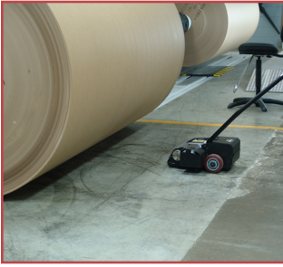
Compact, battery powered Appleton RollMover™