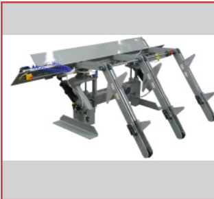
AutoLoader and Elevator